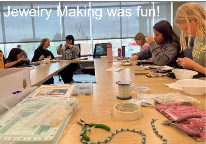
Jewelry Making was fun!

https://losalamosextnsion.nmsu.edu/documents/Project-order-form-fillable.pdf